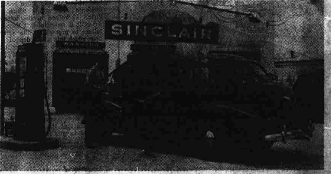
SINCLAIR DEALERS have a war job, too. Four out of five workers use private cars to get to their jobs. Sinclair Dealers are giving these cars the kind of service they need to keep running. Let the Sinclair Dealer care for your car, too.