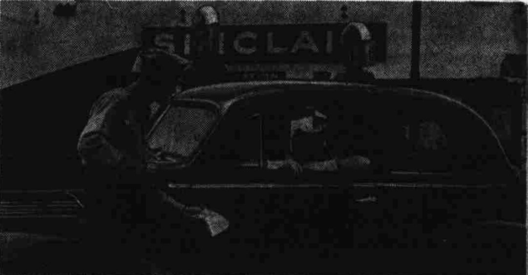
SINCLAIR DEALERS, too, are helping to back the boys in the services by keeping vital war workers' cars in operation. 75% of all cars are estimated to be over age and your car needs regular servicing as never before. Let the Sinclair dealer care for your car to keep it running longer.