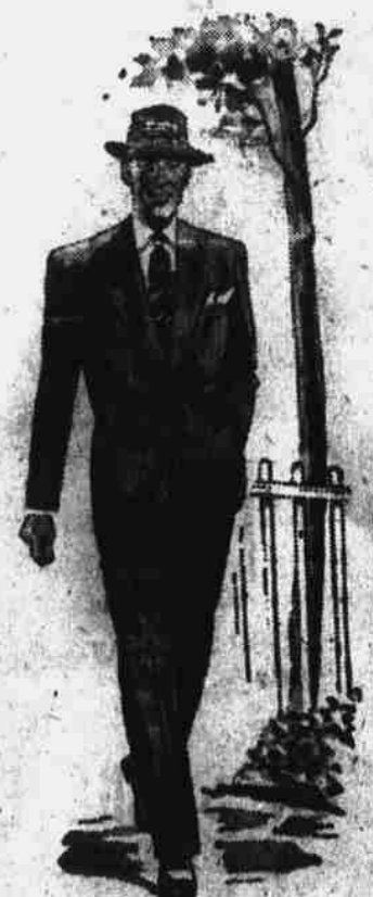
Curlee Tropical Suits

100% Wool Suits that defy the heat and stand up without a wrinkle. All sizes. $26.50