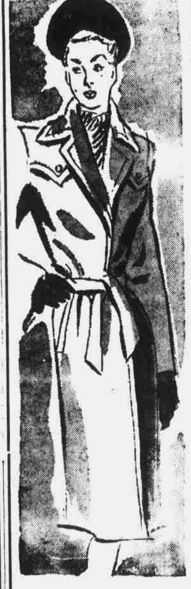
Fig. project coat to keep you warm and comfy all winter long. New-style wrap - around silhouette; welt seams.