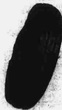
U. S. ROYAL TRI-RIB TIRE

The free rolling tire that doesn't "ball up" . . . holds side slip to a minimum . . . pulls easier and operates smoother on the highway.