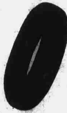
U. S. ROYAL IMPLEMENT TIRE

The tire with the "Backbone" . . . features Greater Traction . . . self-cleaning action and smooth roadability.