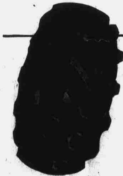
U. S. ROYAL FARM TRACTOR TIRE

The tire with the "Backbone" . . . features Greater Traction . . . self-cleaning action and smooth roadability.