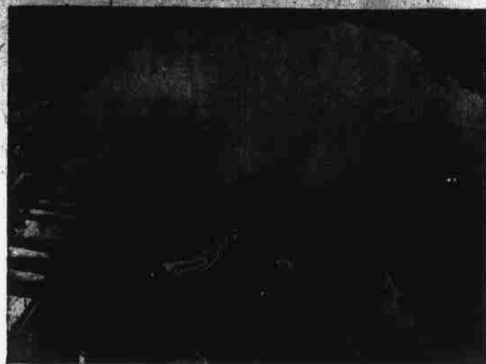
The USS Macon, one of the several ships of the United States Navy assigned to the expanding training program for veterans and non-veterans of the Naval Reserve, takes a wave over the bow on one of the two-week training cruises. Reservists from many Naval Districts take a fortnight out of their civilian life to keep themselves abreast of modern Naval developments by means of the active duty cruises of such craft as the Macon.

A $150 diamond ring from the Jewel Box of Wilmington and Greensboro will grace the hand of the Queen's first Maid of Honor. To the second Maid of Honor will go $150 worth of beautiful airplane luggage.