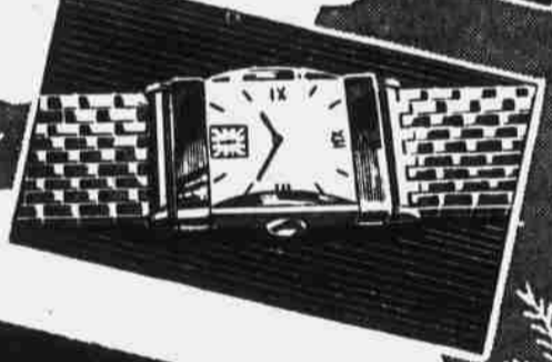
Exquisitely designed watches—all famous name makes. Bulova, Elgin, Gotham. $24.75 up