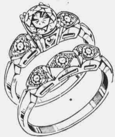
Wedding ensemble Blue white diamonds, gold setting $40.00 up

Nothing in this wide, wonderful world equals the joyous thrill of giving or receiving a piece of exquisite jewelry at Christmas. You and your loved one can enjoy this thrill — select her secret dream from our sparkling holiday collection.