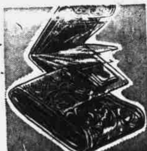
Choose A Billfold! Soft and Pliable 98c

Luxurious aqua-velva shaving lotion, talcum and tube of cream.