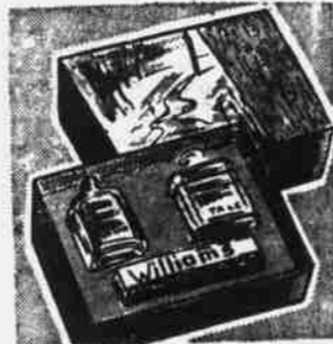
Williams Toiletries No Finer Gift 98c

Luxurious aqua-velva shaving lotion, talcum and tube of cream.