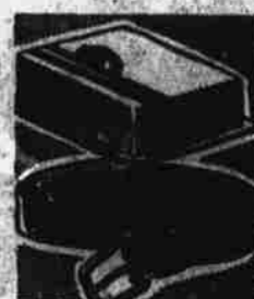
All-Leather Belts In plain or fancy styles. Stitched for long wear. 98c