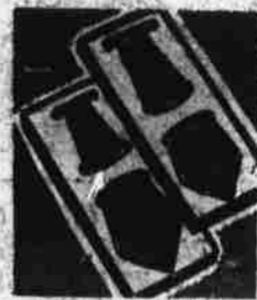
Christmas Ties Solid colors, stripes and prints in new fabrics. 98c

Tailored to hold its shape after repeated washings ... good fitting collars. Excellent for Christmas giving! $2.98