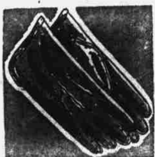
Warm Dress Gloves

Your choice of luxurious fabrics, handsomely tailored into mannish styles. To make him feel at home in his leisure hours! Generously cut ... and will hold their shape!