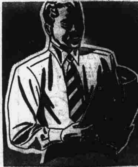
PERFECTLY STYLED FOR BUSINESS! White or Print Hanway Shirts

Tailored to hold its shape after repeated washings ... good fitting collars. Excellent for Christmas giving! $2.98