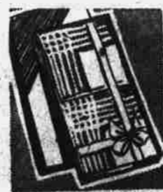
Hankies For Men Two in box, large size with hemstitched edges. Box 69c