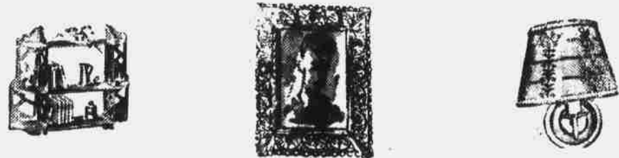
BRIC BRAC PICTURES AND FRAMES WALL LAMPS