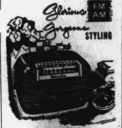
table radio by Motorola

Plenty of power in a compact cabinet—beautifully styled in two-tone brown and tan plastic. Motorola's exclusive Mello-Bass assures rich, vibrant tone in every register. Radar-type tuner for FM. Come in—see it, hear it today.