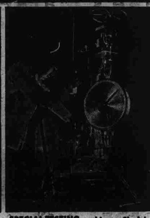
SPECIAL TESTING machines at Sinchis Secor Oll and Genr Lui on check constantly on quality of m protection for your car. film lubricant strength.