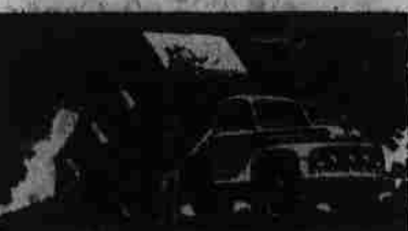
All heavy duty F-5 and F-6 Fords for '51 like this Dump, give you easier, quieter shifting with new, 4-Speed Synchronizing transmission, optional at extra cost.

You'll find these new features in engines, clutch, transmissions, axles, wheels, cabs, Pickup body—wherever there have been opportunities to make