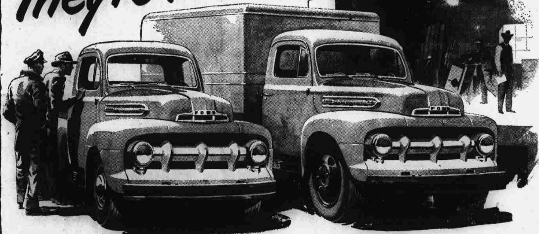
The famous F-1 Pickup... with new features for '51! Plus an important money-saving advancement... the Ford POWER PILOT, standard on ALL new Ford Trucks for '51, from 95-h.p. Pickups to 145-h.p. BIG JOBS!