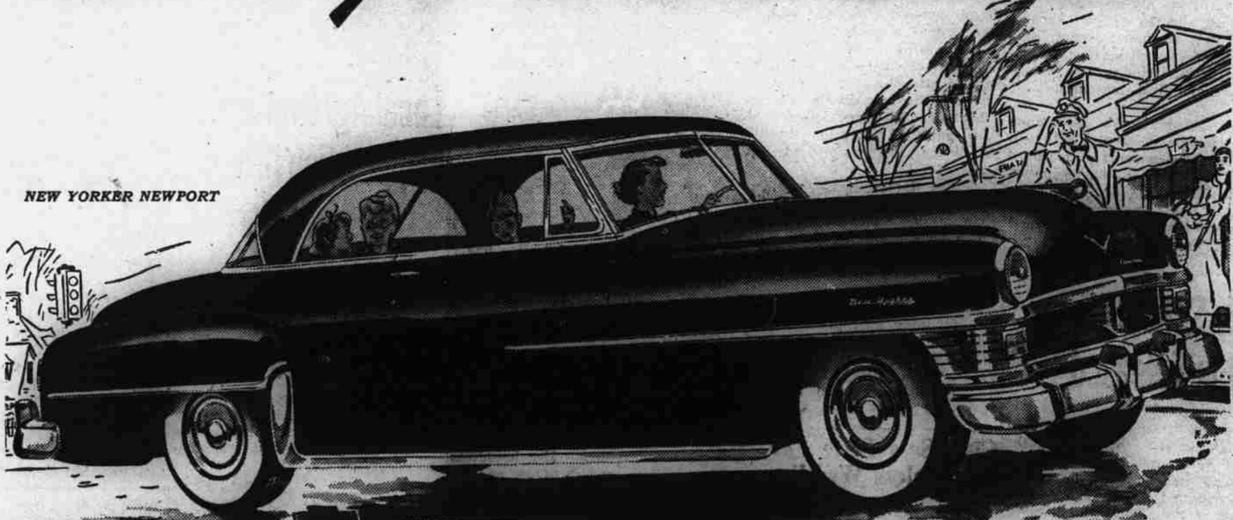
NEW YORKER NEWPORT