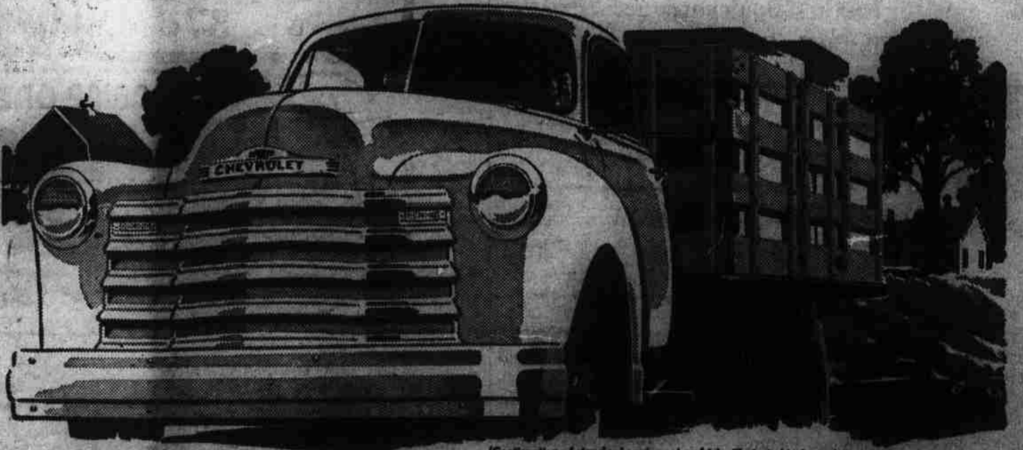
(Continuation of standard equipment and trim illustrated is dependent on availability of material.)

First in demand First in value First in sales