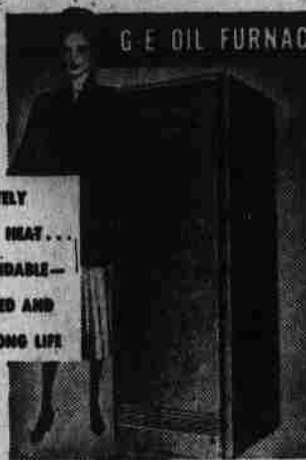
For fast, clean, healthful warm air heat. Filters, humidifies and circulates!

COMPLETELY AUTOMATIC HEAT... SAFE—DEPENDABLE—G-E DESIGNED AND BUILT FOR LONG LIFE