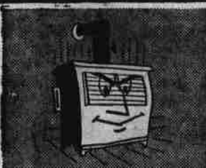
SPACE-HEATER SAM—a poor substitute for real comfort and economy.