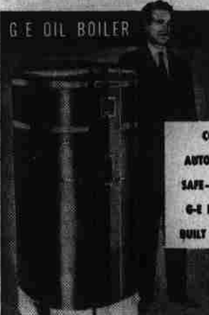
For steam, vapor, hot water or radiant panel heating systems. Quick response and high efficiency.