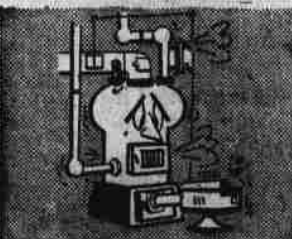
CONVERSION-UNIT CHARLIE—"converted" to a fuel he wasn't designed to burn.