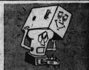
NEW-FURNACE NED—just another old-timer—a furnace with a burner added.