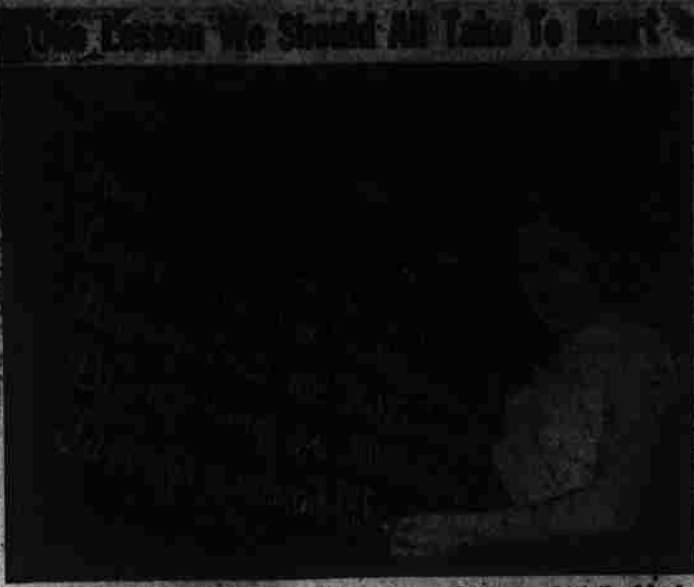
Piper Laurie, the Universal Pictures star, looks good at the blackboard but points she is making is even better. The familiar Series E Savings Bond is again doing double duty. It now backs up our Defense forces as well as your future. It is doing a job for peace because peace is for the strong. Defense Bonds help to keep the American economy strong. You may now hold your Series E Defense Bonds another 10 years. Looking ahead, here is how they will add up—$75.00 plus 10 years equals $150.00. $75.00 plus 20 years equals $153.33. In 30 years you will receive 77 per cent more than cost price. Your Bonds are better than ever!

and save themselves loss and embarrassment and penalties, by making sure that they file only when they fully meet all these requirements. Employers can render considerable aid by warning their employees against attempting to collect or to help others to collect benefits when some one or more of these conditions are not fulfilled.