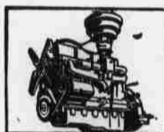
105-h.p. Loadmaster valve-in-head engine