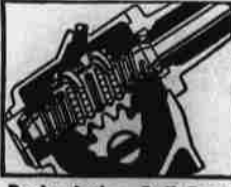
Recirculating Ball-Gear steering