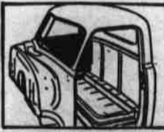
Battleship-construction double-walled cabs