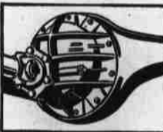
Hypoid rear axle