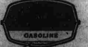
When fuel is replaced by condensation in every car's gasoline tank—causes rust and corrosion throughout whole fuel system when you use ordinary gasoline.

Today ordinary gasoline has become old-fashioned. Today, your Sinclair Dealer offers you POWER-PACKED Gasolines with an amazing EXTRA VALUE —a new chemical ingredient that solves the problem of rust and corrosion in your gasoline tank and fuel system. It's RD-119 , a product of Sinclair Research.