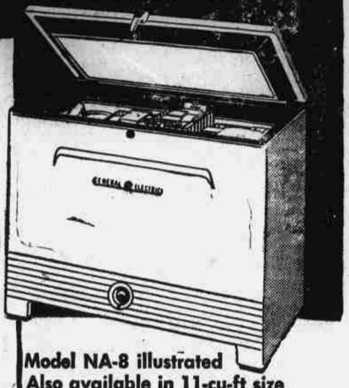
Model NA-8 illustrated Also available in 11-cu-ft size