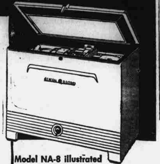
Model NA-8 illustrated Also available in 11-cu-ft size