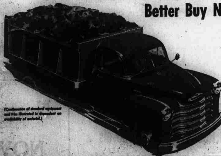
(Construction of standard equipment and trim illustrated is dependent on availability of material.)

MORE CHEVROLET TRUCKS IN USE THAN ANY OTHER MAKE!