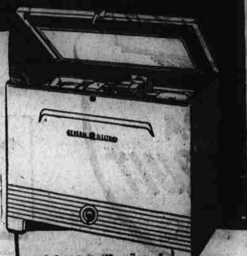
Model NA-8 illustrated Also available in 11-cu-ft size