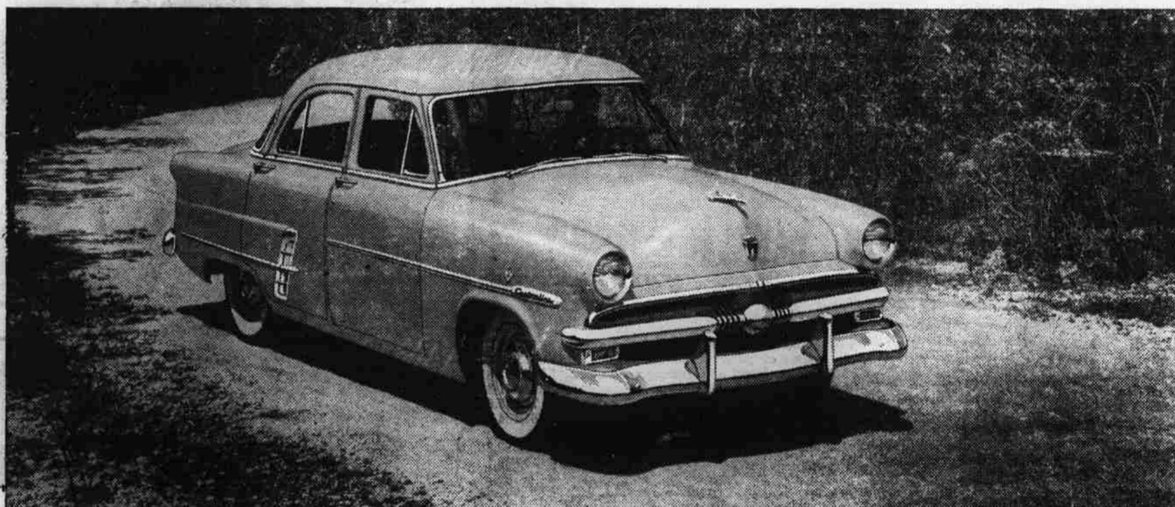
While styled lines optional at extra cost. Equipment, accessories and trim subject to change without notice.

bounce, pitch and sway to bother you, no uncomfortable roll on curves. Ford's new Miracle Ride marks a new era of riding comfort and quiet. It's another big reason why Ford is worth more when you buy it ... worth more when you sell it!