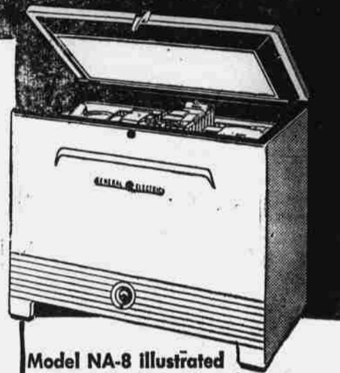
Model NA-8 Illustrated Also available in 11-cu-ft size