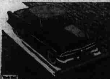
NEW FORD WONDER RIDE makes roughest roads feel velvet smooth. It's a brand new kind of ride made up of many advanced features like: Ford's more responsive springs, new softer shock absorber action, wide front track and many others.

You get your choice of league-leading "Go" in the '53 Ford's V-8 and Six power plants. Yet it's economical "Go" with Ford's Automatic Power Pilot watching every drop of gas. In Ford's Crestmark Body you get "living" room that's the finest and most comfortable in the low-price field. And you get Ford's new Wonder Ride that will give you a new slant on how a car should ride.