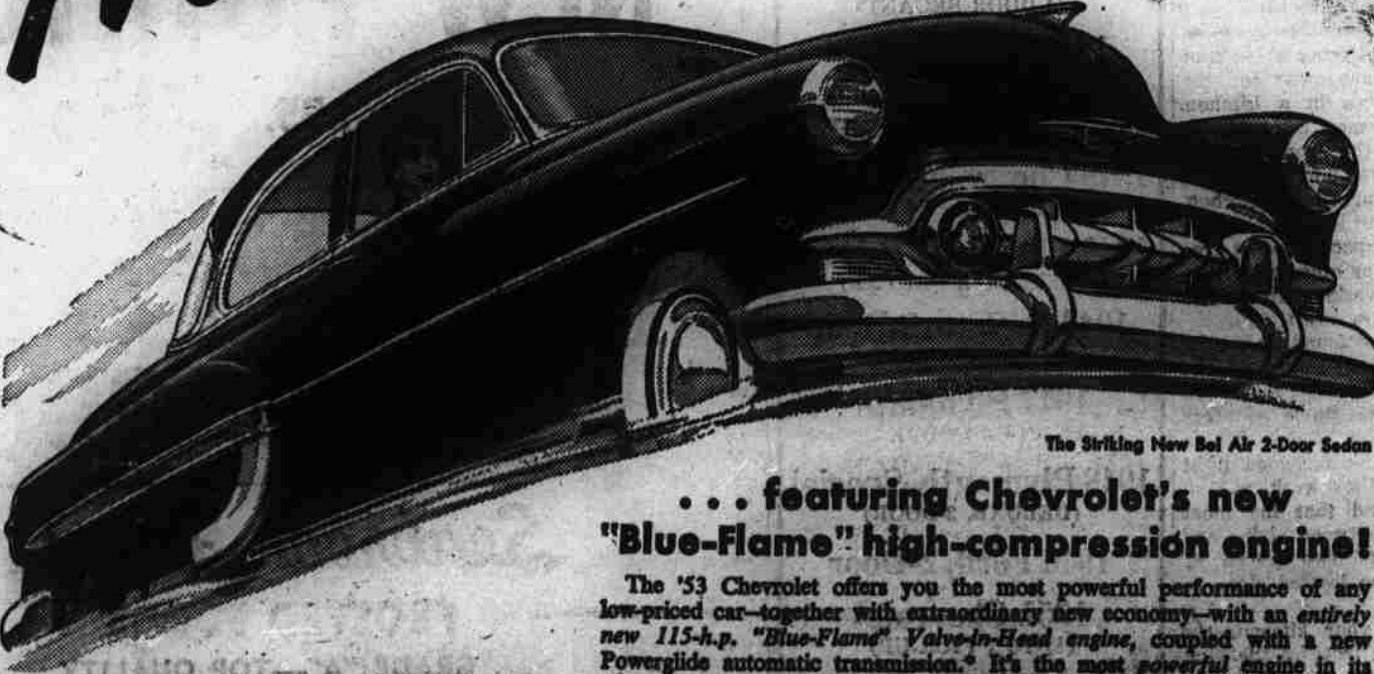
The Striking New Bel Air 2-Door Sedan