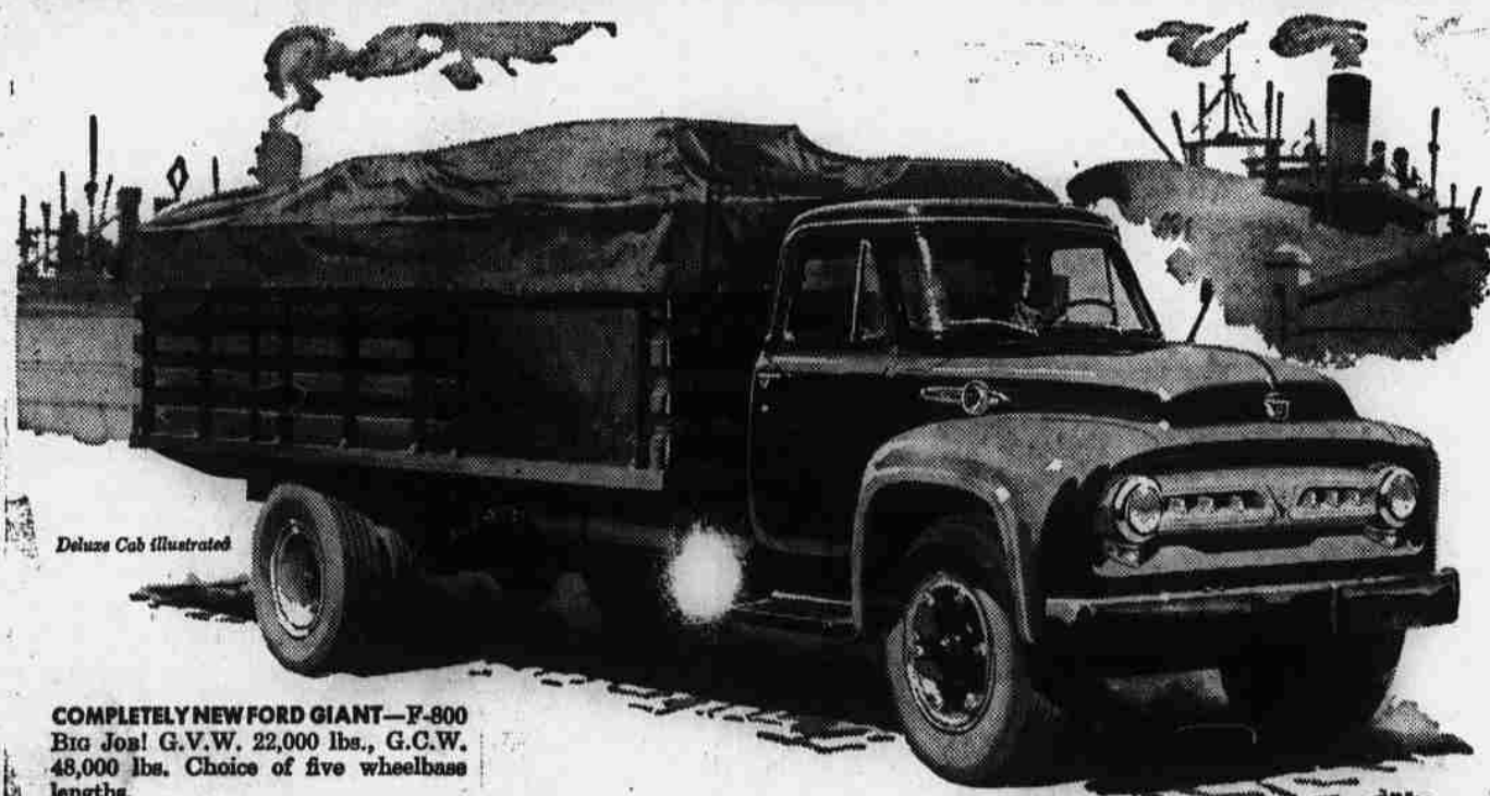
Deluxe Cab illustrated COMPLETELY NEW FORD GIANT—F-800 Big Job! G.V.W. 22,000 lbs., G.C.W. 48,000 lbs. Choice of five wheelbase lengths.

EVERYTHING you've ever wanted in a truck— ALL IN THE GREAT NEW FORD TRUCKS!