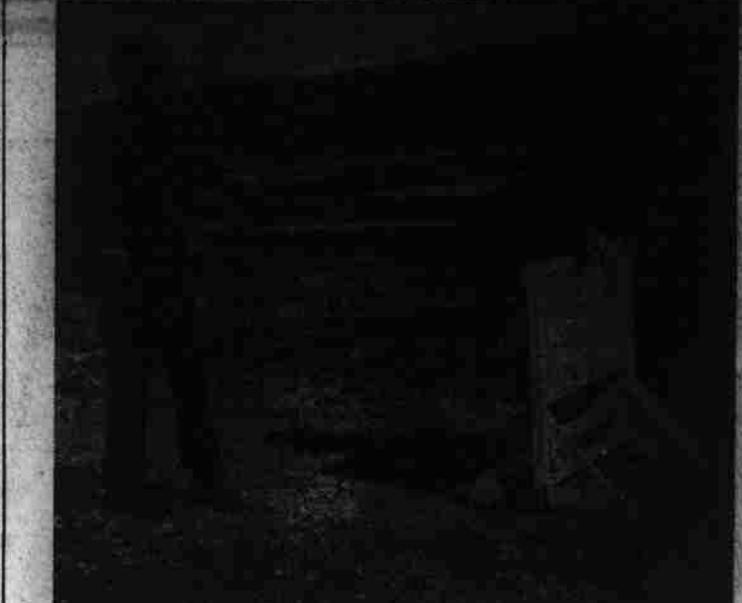
WITH A GRACEFUL LEAP, this Army dog clears an obstacle at the Army Dog Training Center at Camp Carson, Colo. During basic training at the camp, dogs learn to obey commands of their handlers. The command for clearing hurdles like the one shown above is "up and over."

The ole' swimmin' hold can be the last place you will visit on earth—unless you are careful.