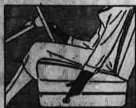
New, automatic window and seat controls

Now Chevrolet brings you Power Brakes to make stopping wonderfully easy and convenient. Optional on Powerglide models at extra cost.