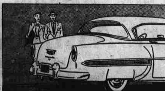
New styling that will stay new

The touch of a button adjusts front seat and windows. Optional on Bel Air and "Two-Ten" models at extra cost.