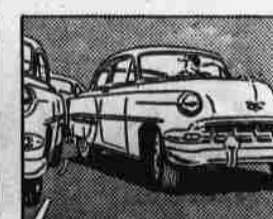
Thrifty new power in all models

Fine new upholstery fabrics with a more liberal use of beautiful, durable vinyl trim. New color treatments in harmony with the brilliant new exterior colors.