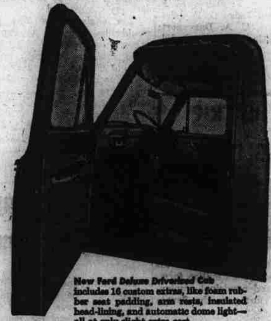
New Ford Deluxe Driverized Cab includes 16 custom extras, like foam rubber seat padding, arm rests, insulated head-lining, and automatic dome light—all at only slight extra cost.

AND FORDOMATIC DRIVE! Fordomatic Drive now available at low extra cost on 44 Ford light duty models, up through one-tonners! No clutch, no shift. Faster getaway, easier hill-climbing. Takes up to 90% of the work out of driving!