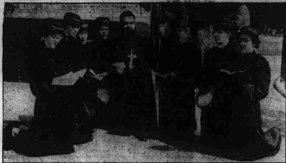
"INVADERS" RE-ENACT LANDING—There's been an "Army of Occupation" on United States soil for 75 years, and the group above, clad in costumes of yesterday, is re-enacting its arrival during ceremonies held at Battery Park, New York City. Cadets of the Salvation Army Officers' Training School play the parts of the original seven women and one man who arrived in New York in 1880 from Australia, to found the Salvation Army in the United States.

OUR AIM IS TO GIVE YOU THE BEST POSSIBLE SEED IN THE MOST ECONOMICAL MANNER. A TRIAL WILL CONVINCe YOU! REMEMBER THE LOCATION AND DATE