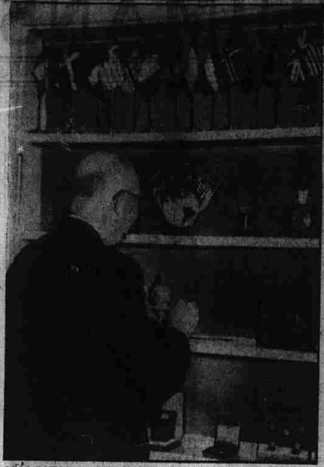
COLLECTOR'S ITEM — The term applies to both the world globe, surmounted by flags of the 21 countries of the Americas, and this unusual camera study of President Eisenhower. Gift of Lions International, the plaque occupies a prominent spot in Ike's White House office souvenir case, symbolizes unity of the family of American nations.