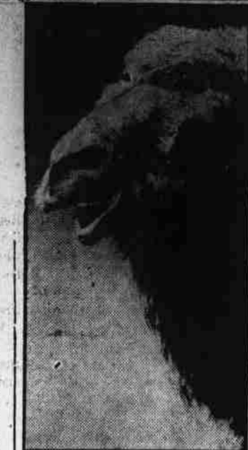
SPITTIN' IMAGE —Don't let the modestly lowered lashes and smirking smile fool you. The grin's built-in on this camel at the London, England, zoo, and the demure, almost bashful look is designed to lure you within spitting distance. Then—PULL.

—Try— Wate-On GUARANTEED to make you gain weight or your money back. Now Available Liquid or Tablets Come In Now S and M "ON THE CORNER"