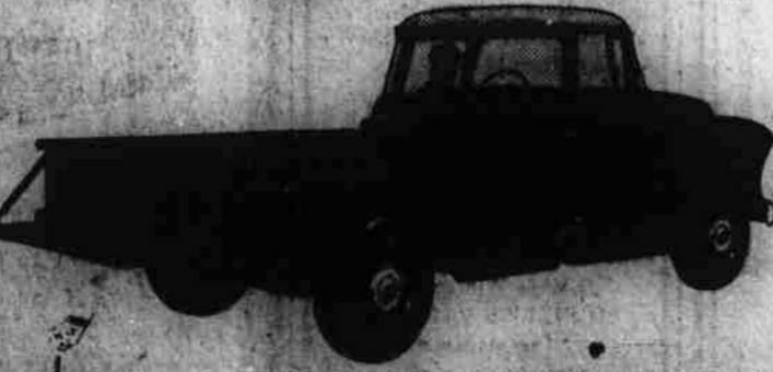
Model 3604 - 3/4-ton, 90" box