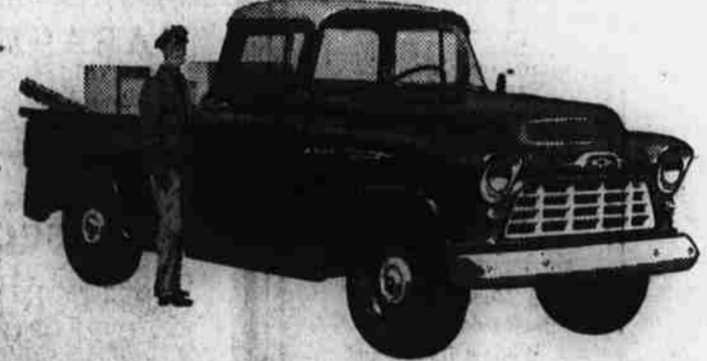
Model 3104 - 1/2-ton, 78 1/4" box