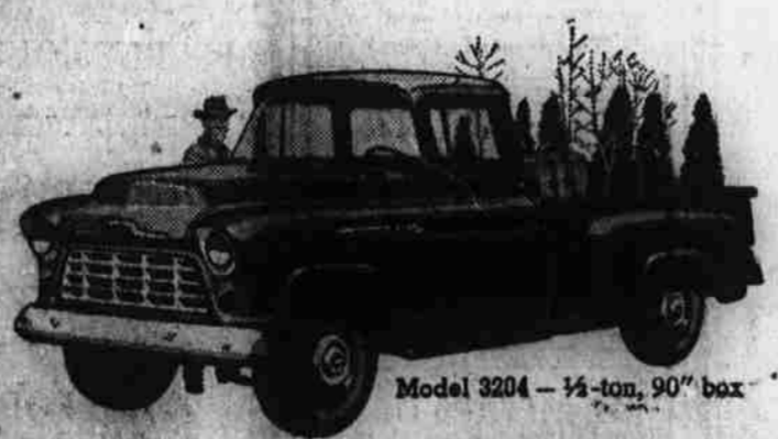
Model 3204 - 1/2-ton, 90" box