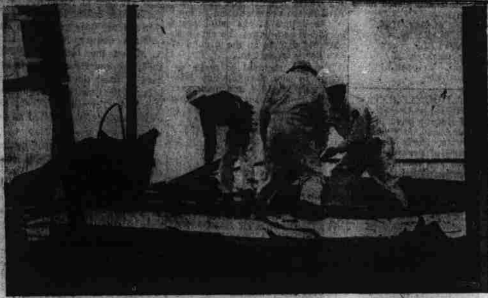
TRAINED CIVIL DEFENSE rescue workers can play just as important a life-saving role in peace as in war, as these men in tornado-devastated Standale, Mich., a suburb of Grand Rapids, recently demonstrated. Rescue volunteers are taught how to reach trapped victims safely and quickly through the Federal Civil Defense Administration's Olney, Md., rescue school.