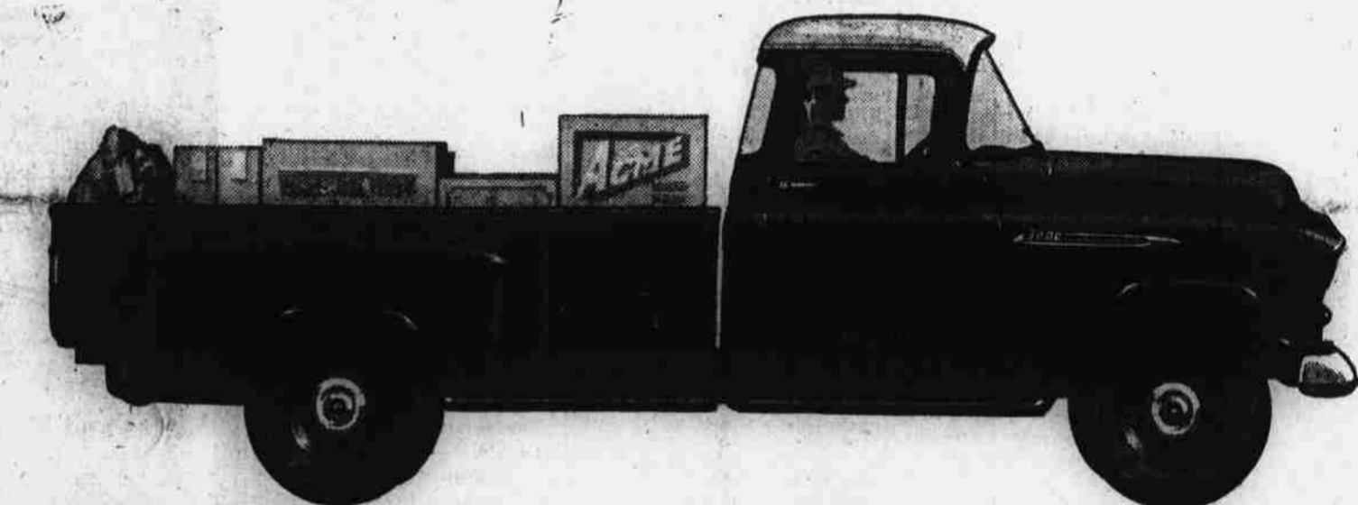
Model 3804 - 1-ton, 108 1/4" box

Power up with SINCLAIR POWER-X Baker Oil Company SINCLAIR PRODUCTS