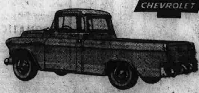
Cameo Camper - sharpest Pickup on the road!