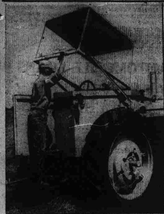
FARMER'S DREAM COME TRUE —Demonstrating the ultimate in farm luxury, a Doylestown, Pa., farmer lifts the glass and steel cover on an all-weather tractor. The cabin provides air-conditioning for the summer and heat for the winter. The tractor also has a push-button radio.