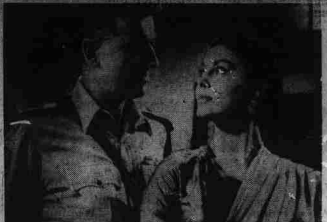
STEWART GRANGER and AVA GARDNER in a scene from MGM's "BHOWANI JUNCTION." CinemaScope and Color.

G.O.P. control of Congress, would put into the hands of Republicans the power resulting from chairmanship, of committees and titular leadership of both houses. This might mean a new approach toward certain leftwing or civil rights legislation that many southerners feel is unconstitutional.