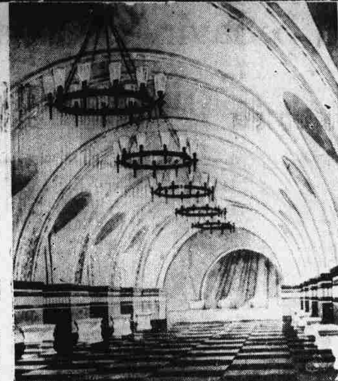
FAR CRY FROM TIMES SQUARE—This elaborate hall, looking like part of a royal palace, is slated to become part of the Moscow subway system. It is the central hall of the Frunzenkaya Station of the city's Frunze line, scheduled to begin operation this year. Artist's sketch and caption material are from an official source.

The automobile is supplied by Nationwide Insurance. A safety engineer for the firm will ride beside the driver and operate the equipment. Nationwide engineers have staged similar demonstrations before more than 5,000 student groups in eastern United States.