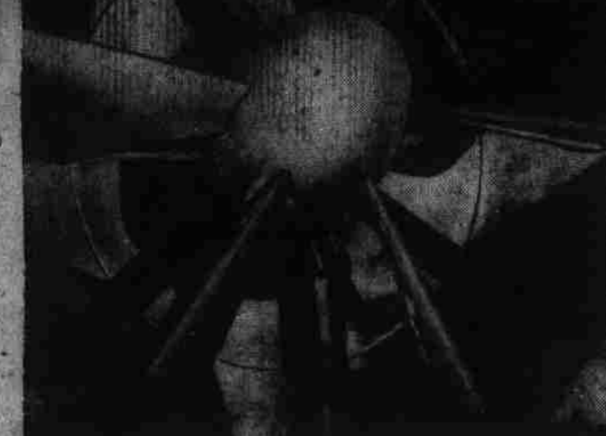
COOL VISTA —Cool off during the next hot spell. Imagine that you're standing in the draft from this huge, 22-foot-diameter fan. It's located in an all-wood wind tunnel, said to be the largest of its kind ever built. Gates of 200 miles per hour shriek through the tunnel to test aircraft designs at an aircraft works in Bristol, England.

A farmer must comply with all crop allotments and his acreage reserve contract to be eligible for Soil Bank payments. Farmers violating their contract will be required to forfeit all payments earned under the contract and will be subject to a civil penalty.