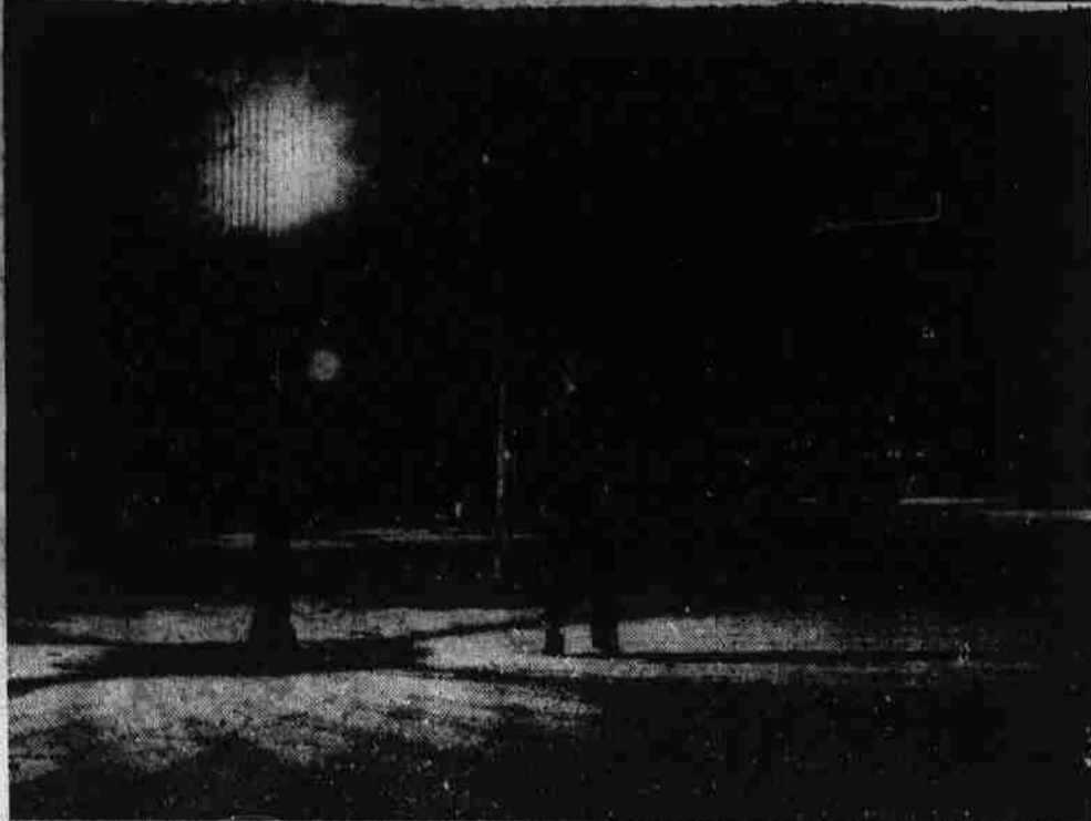
DARK AND LONELY NIGHT —By day mothers watch their children at play, and the elderly rest in Highbridge Park, in the Washington Heights section of New York. By night, a deadly silence fills the abandoned place of fear. A lone policeman watches the shadows. For here a 15-year-old boy, crippled by polio and unable to run, was stabbed to death by a teen-age gang. Nightfall and fear has emptied this park. But the police are there trying to check the awful rise in juvenile crime.