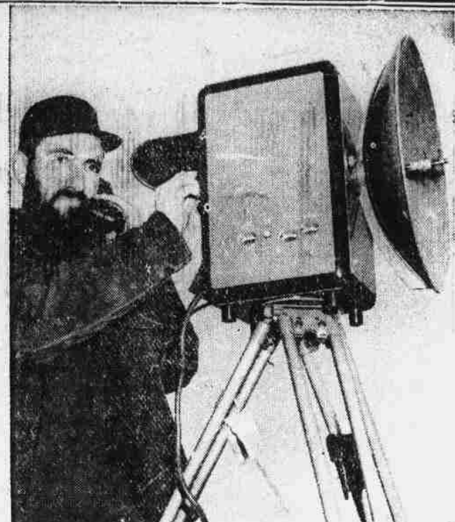
GETTING THE COLD FACTS —A remote operator of the Tellurometer, a revolutionary new device for measuring distance by microwave, contacts the master station during a survey in the Bellot Strait area of Canada's Northwest Territories. Two men using the Tellurometer, introduced into the U.S. Navy's Military Sea Transportation Service for 1957 operations, can establish a seven-mile base line that would take 60 men using conventional equipment 25 days to survey.