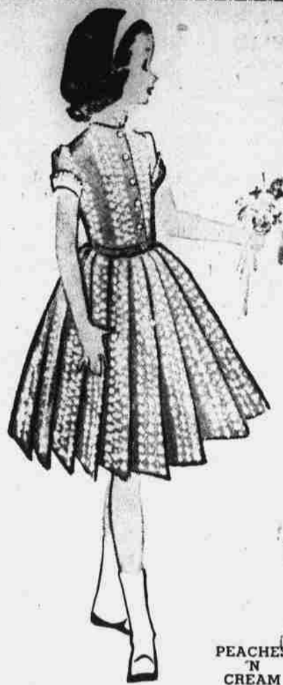
PEACHES 'N CREAM

Snowflake Print by Cohn-Hall-Marx on crease-resistant cotton. Needs little or no ironing. Soft pleats all around skirt. Buttons down the front. White mandarin collar and cuffs edged with Venise lace of ball design. Pink or blue.