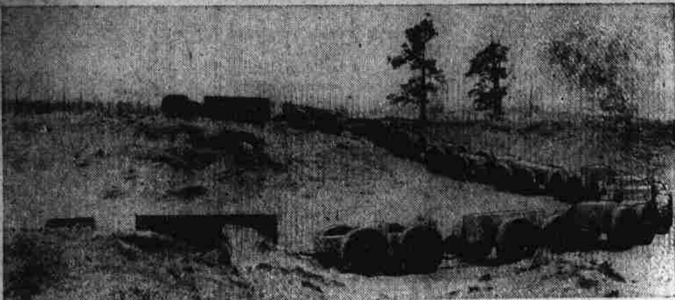
ARMY'S MECHANIZED CATERPILLAR—Resembling a huge, wheeled caterpillar, the Army's overland train demonstrates its tracking ability during tests. Each of its 52 wheels has its own power drive. Each wheel mounts a tire 10 feet high and four feet wide. The 12-unit, 450-foot-long train is designed for use in regions where there are no roads or railroad facilities.