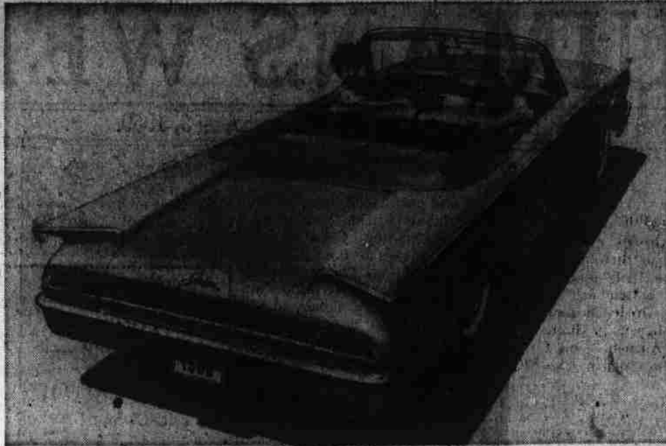
The 1960 Ford Sunliner is one of 15 models in the new Ford line which will be introduced October 8 in Ford dealer showrooms across the nation. Featuring the strikingly modern rear deck and fast-wing motif, the new Fords are five inches longer, five inches wider and have more interior leg, hip, shoulder and head room than before. Ford's new integrated design, harmonizing the interior with a single, flowing exterior streamline, is proof that modern styling need not be radical or eccentric.

United States, even though he be an idiot or an unrepentant felon under conviction for a crime involving moral turpitude. When all is said, the only reason assigned for the proposal that the states be robbed of the right to prescribe intelligence tests for voters and barred from depriving unconfined idiots and unconfined felons from the elective franchise is simply this: That it is alleged that in a comparatively few areas of the country supposedly qualified persons have been denied the right to register and vote, and that it would be easier to establish the truth of such allegations in the future if the only qualifications required of voters were the possession of a physical body, with or without intelligence and character, plus an attained age and a fixed place of residence. Would Be Unwise For Congress and the states to heed this proposal for such a Constitutional Amendment would be about as sensible as using an atomic bomb to destroy a few rats. As I have already pointed out in a previous column, there are now sufficient Federal statutes to prevent or punish any provable charges that any qualified person is being wrongfully denied the right to register and vote in any of the 165,115 voting precincts in the fifty states comprising the Union. Other proposals will be discussed in next week's column.