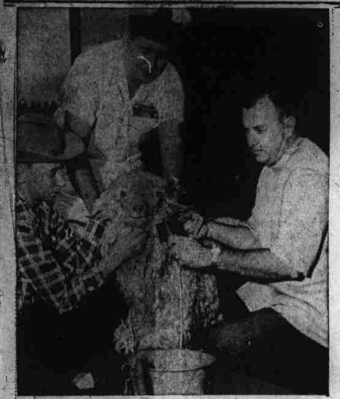
"SINK THE ARMY"—New mascot for the U.S. Naval Academy, "Billy XVI," gets spruced up for presentation to the middles. Beauty treatment takes place in Dallas, Tex., on the pedigreed Angora, who replaces one which died recently.