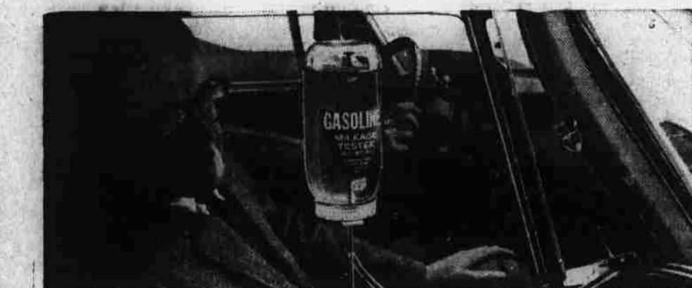
CLOSE-UP OF ECONOMY! Here's the PLYMOUTH PROVE-IT-YOURSELF ECONOMY METER in place. And when you take the test drive, note that brilliant performance is built into the Plymouth engines—including the new design 30-0 Economy Six and the famed Plymouth Fury V-800. YOU'LL ENJOY taking the PROVE-IT-YOURSELF ECONOMY DRIVE... because you see the savings! And, all of the time, you'll enjoy unusual ease of driving and handling.

At your dealer's now! YOU take the wheel! YOU do the driving! YOU prove how the Solid Plymouth gives more miles per gallon! Go to your Plymouth dealer's and take the wheel of a regular Plymouth. You do the driving... the way you always drive. The ECONOMY METER mounted at the side shows the gas you use. See with your own eyes exactly how many miles you got on only teacups of fuel in a Solid '60 Plymouth! Here's the gas saving you've been looking for. Get FULL-SIZE SAVINGS IN A FULL-SIZE CAR.