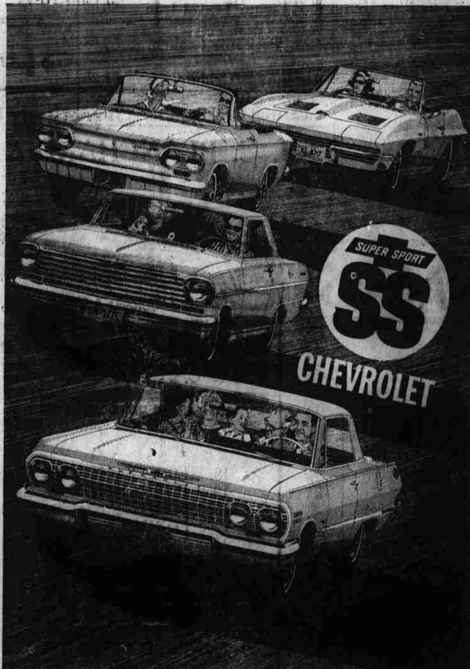
Pictured from top to bottom: Corvair Monza Spyder Convertible, Corvair Monza Spyder Convertible, Chevy II Nova SS Coupe, Chevrolet Impala SS Coupe. (Super Sport and Spyder equipment optional at extra cost.)

SUPER SPORTS —that's the only name for them! Four entirely different kinds of cars to choose from, including bucket-seat convertibles and coupes. And most every one can be matched with such sports-car type features* as 4-speed stick or Powerglide transmission, Powertraction, tachometer, high performance engines, you name it. If you want your spice plus the luxuries of a full-sized family car, try the Chevrolet Impala SS. It's one of the smoothest road runners that ever teamed up with a pair of bucket seats. It even offers a new Comfortilt steering wheel* that positions right where you want it. The new Chevy II Nova SS has its own brand of excitement. Likewise the turbo-supercharged rear-engine Corvair Monza Spyder and the all-new Corvette Sting Rays. Just decide how sporty you want to get, then pick your equipment and power—up to 425 hp in the Chevrolet SS, including the popular Turbo-Fire 409* with 340 hp for smooth, responsive handling in city traffic. *optional at extra cost