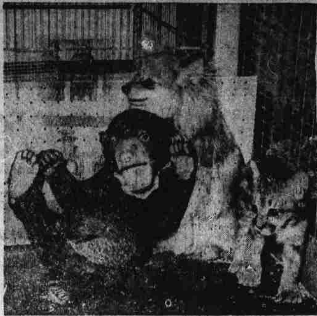
GRIN AND BEAR IT —It appears that "Taffy," a Pomeranian dog, just bears it all with a grin as "Yogi," a Sun Bear cub, gets it in his head to lean Taffy's way. Cage mate, nameless Puma cub, walks away from the whole thing, saying don't bother me, at a Bladensource, Md., pet shop.

(Continued From Page Four) emphasizes faith as more basic than works. We are to accept God's grace as it is expressed in Jesus Christ, and then we are