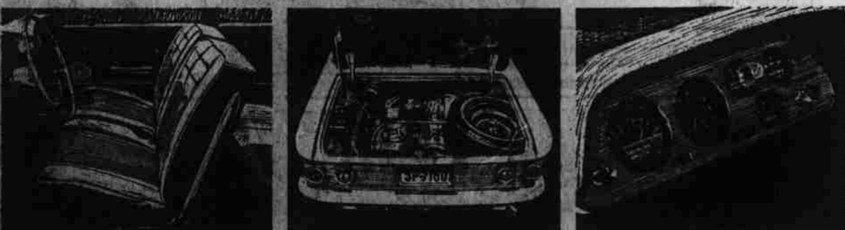
Slung twin bucket seats up front! Turbo-supercharged 150-hp engine! Sharp eye-ful of special gauges!