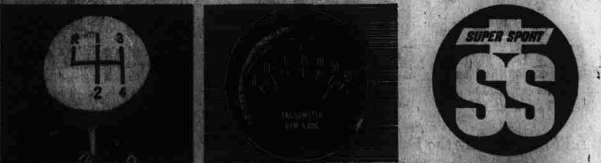
Crisp 3 or 4-speed* floor shift! Tachometer for split-second timing!

*Optional equipment* is available on both Corvair Monza Convertible and Club Coupe (shown above). *Optional at extra cost.