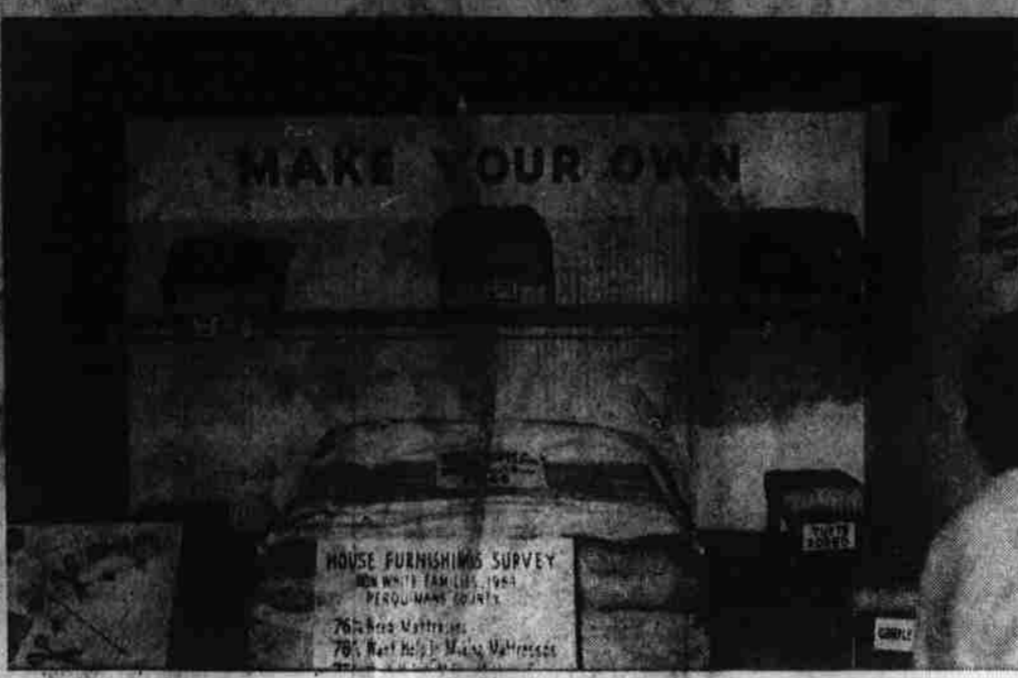
WINS AT STATE FAIR... Perquimans County Home Demonstration clubs were winners of $250 in premium money for their exhibit at North Carolina State Fair this year.

The building will have to be located within 300 yards of present site, with interior space of 800 square feet, loading platform of 80 square feet, and driveway, parking, and maneuvering area of 3,000 square feet.