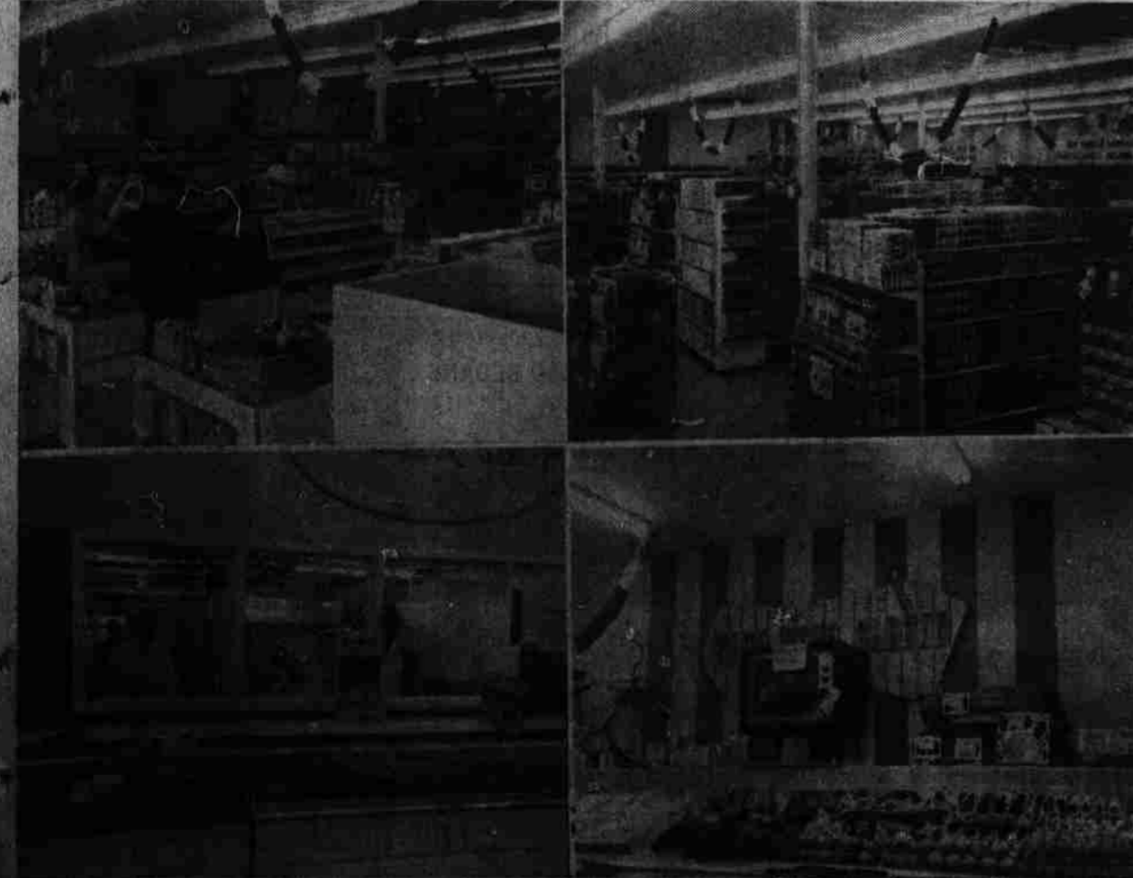
COLONIAL'S BEAUTIFUL NEW STORE OPENS—The above shows one of the interior of the beautiful new Colonial Store. The store has a complete stock of groceries, produce and meat departments including a complete self-service Meat Department. The store is open from 9:30 A.M. to 9:00 P.M. with a steady stream of traffic passing through the electric doors.

A few friendly words, spoken at the right time, can work wonders. You don't give it much attention until it's too late.