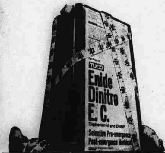
C-1447 © 1969 By The Upjohn Company

TUCO TUCO Products Company, Agricultural Division, The Upjohn Company, Kalamazoo, Michigan 49002