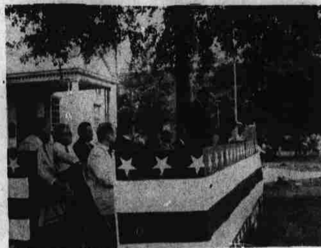
Honorable Walter Jones Speaks at Hertford Flag Day Ceremony.