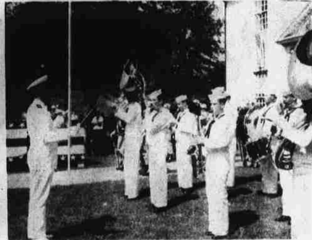
Atlantic Fleet Band Participates in Flag Day Festivities.