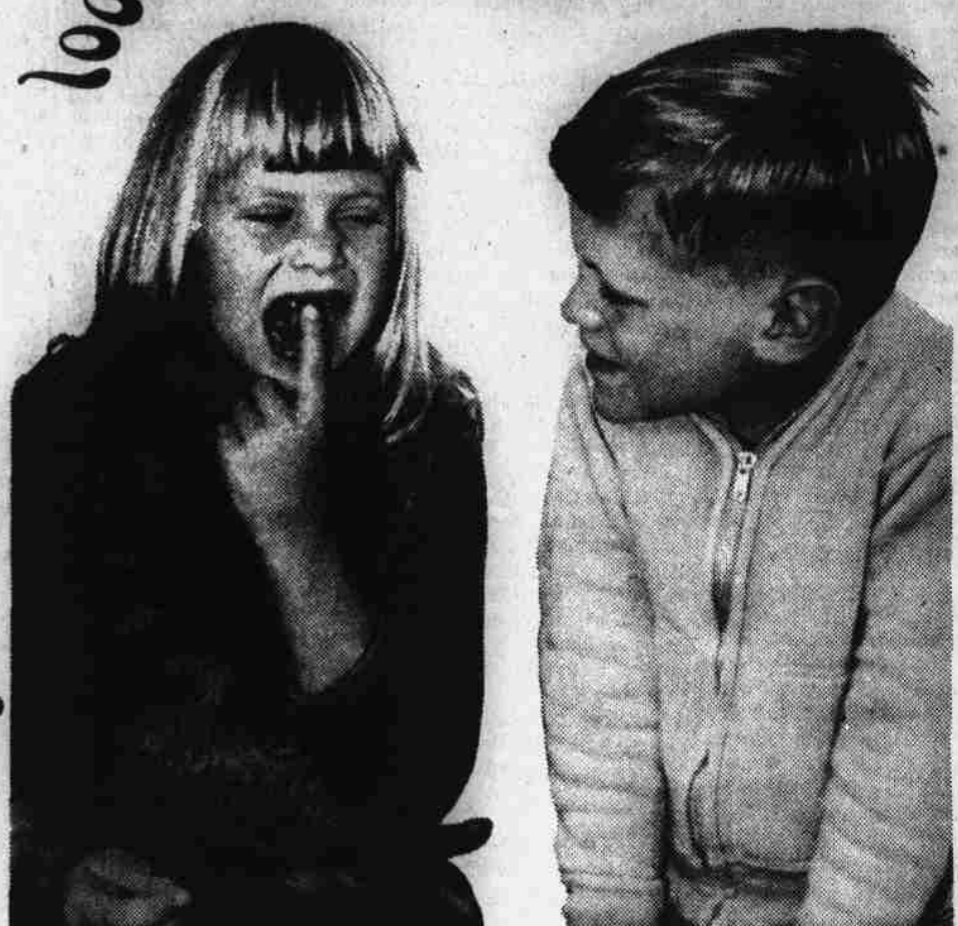
A child can be proud of a missing tooth. She knows it will grow in later, better and stronger than ever.

It's different with the opportunities a child may be missing! Like the opportunity to gain the spiritual and moral foundation for adult life . . . and the opportunity to gain inspiration and example from the religious faith of parents . . . and the opportunity to find wholesome interests and friendships among the boys and girls at church.